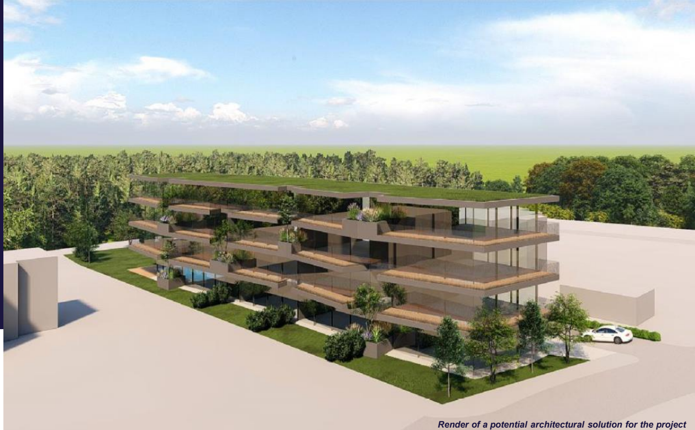
Render of a potential architectural solution for the project

Under the urban development plan, the site is designated for multi-family residential building .