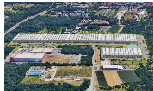
CTPark Belgrade City, 135,000 sq m GBA

Cushman & Wakefield (NYSE: CWK) is a leading global commercial real estate services firm for property owners and occupiers with approximately 52,000 employees in nearly 400 offices and 60 countries. In 2023, the firm reported revenue of $9.5 billion across its core services of property, facilities and project management, leasing, capital markets, and valuation and other services. It also receives numerous industry and business accolades for its award-winning culture and commitment to Diversity, Equity and Inclusion (DEI), sustainability and more. For additional information, visit www.cushmanwakefield.com .