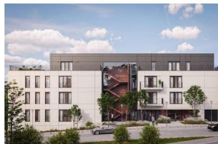
Inobacka Dedinje, Omladinska, Savski Venac

Also, Lisicji potok settlement along Omladinska Street is a very active area lately within this municipality, with several small-scale, high-end projects in the construction phase, e.g., D'HOME, Merin Dedinje, Elysian Lux Gardens, Fox Creek Residence, while Inobacka company, based in Novi Sad, aims to develop project named Inobacka Dedinje, totalling 16 luxury apartments.