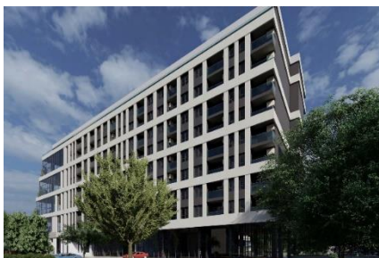
Terminal 10 Residences, New Belgrade

In terms of large-scale projects, Savski Venac is the most active municipality. Specifically, 20 skyscrapers within the Belgrade Waterfront project are currently under construction, while Belgrade's city centre will be enriched by the latest project King's Circle Residence, at the most attractive location on a Slavija Square.